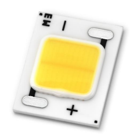
Sharp Mini Zenigata Array