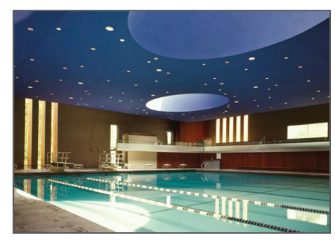
Recessed down-lighting in residential and commercial buildings

LED Array Holder for Sharp* Mega Zenigata (COB) and Sharp Mini Zenigata (COB) Arrays