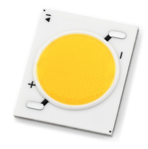
Sharp Mega Zenigata Array