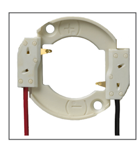
LED Array Holder for Mega Zenigata (COB) Array

Provides Zhaga compliant landing interface for optical