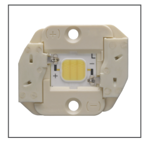
LED Array Holder for Mini Zenigata (COB) Array